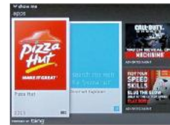
Figure 2. After you download the Pizza Hut app, it appears in your My Apps area.

Somewhat like Windows 8, applications live on the Xbox 360 Start screen. You can jump to that screen by saying: "Xbox. Apps." There you'll see my apps in a small box in the lower-left corner of the screen. Say, "Xbox. My apps." to access applications you've downloaded — including the Pizza Hut app, in my case (see Figure 2).