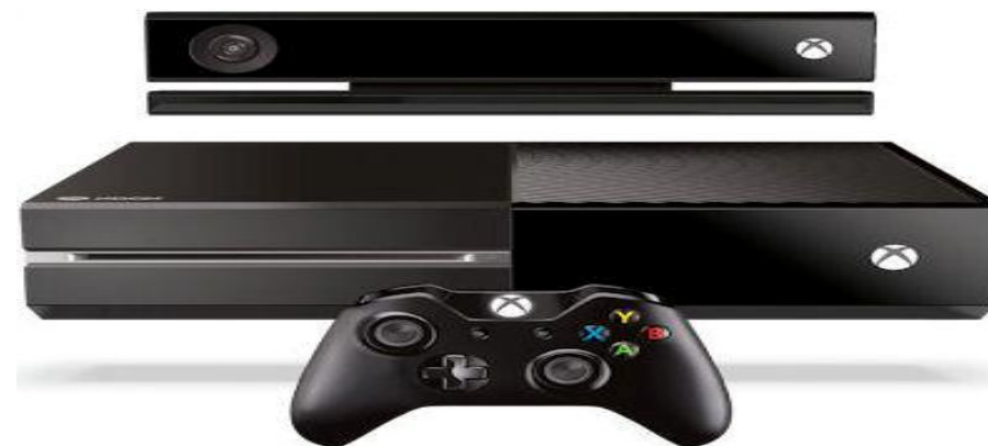
Figure 4. The new Xbox One, due out in November

Xbox One will include a dramatically improved Kinect built in. It can track heartbeats, muscular movement, and even your facial expressions — which is already generating discussions about personal privacy, as reported in a June 13 Rolling Stone article <http://www.rollingstone.com/culture/news/xbox-one-features-create-privacy-concerns-20130613> . It'll even know when you're bored, frustrated, or scared while playing a game.