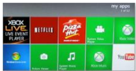
Figure 3. You build your pizza by stating your preferences

The Pizza Hut app includes the usual menu choices such as pizza toppings, chicken wings, breadsticks, and drink. To make selections, say, "Xbox" to display the audio commands; then say or position the hand icon over the items you want (see Figure 3). It's really that simple. After you've selected your pizza toppings (you see images of pepperoni, sausage, and mushrooms as you call out these ingredients), say "Add to order." The Pizza Hut app moves you along to the finish line, where you can finalize the order and submit it.